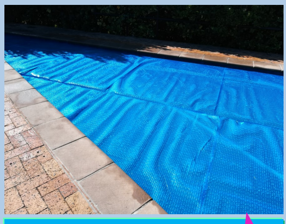
POOLCOVERS.CO.ZA CLICK TO ORDER NOW!